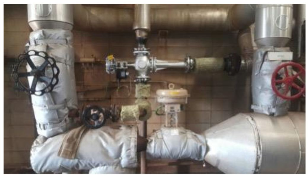
installation on side, Sugein-Spain

The new system was installed on the 09th of January in 2017 onside.